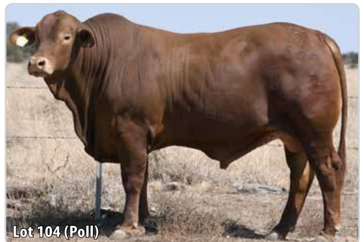
Lot 104 (Poll)