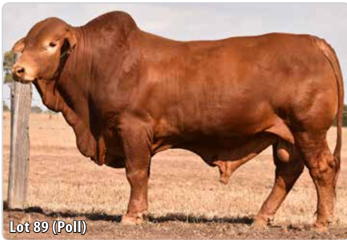
Lot 89 (Poll)