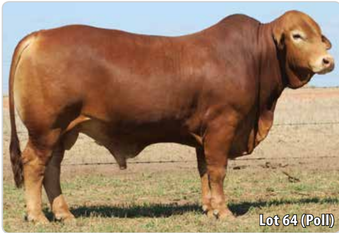
Lot 64 (Poll)