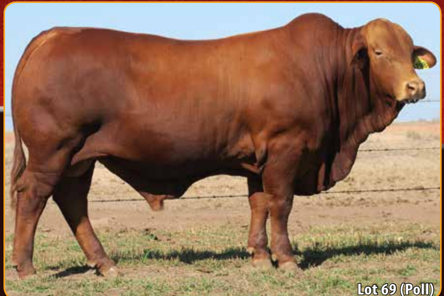
Lot 69 (Poll)

Dalrymple Saleyards Charters Towers North Queensland