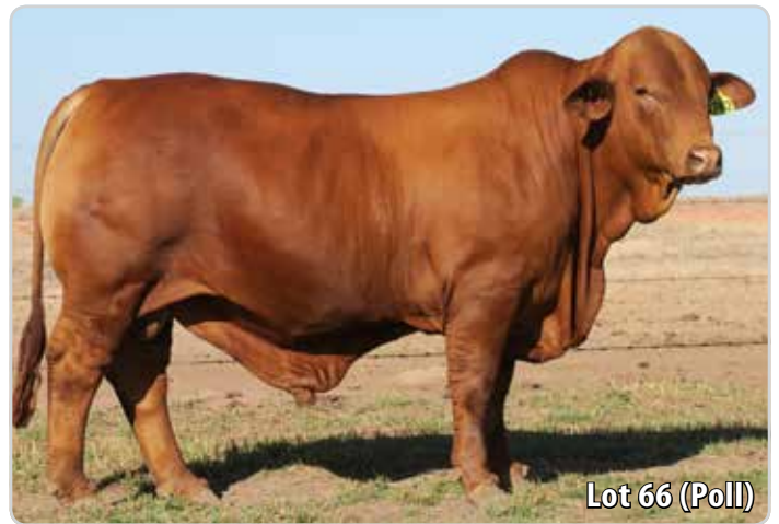
Lot 66 (Poll)