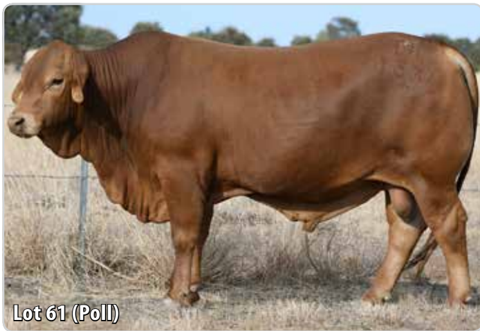
Lot 61 (Poll)