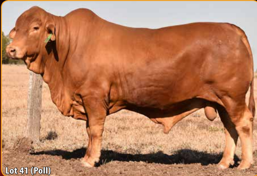
Lot 41 (Poll)