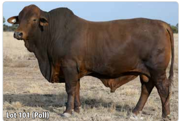
Lot 101 (Poll)