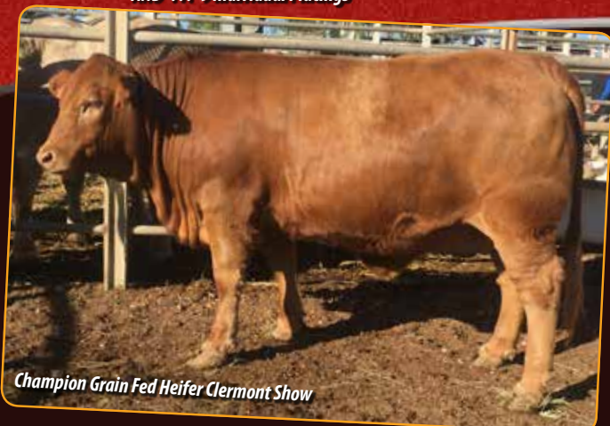
Champion Grain Fed Heifer Clermont Show