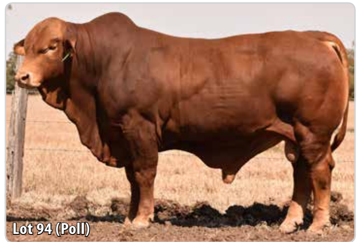
Lot 94 (Poll)