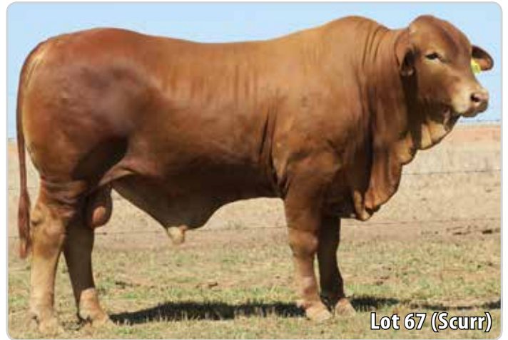
Lot 67 (Scurr)