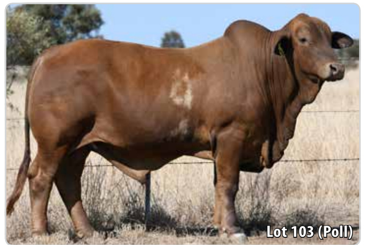
Lot 103 (Poll)