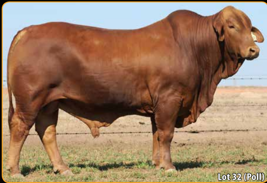
Lot 32 (Poll)