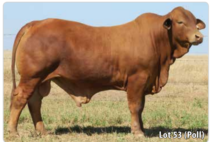
Lot 53 (Poll)