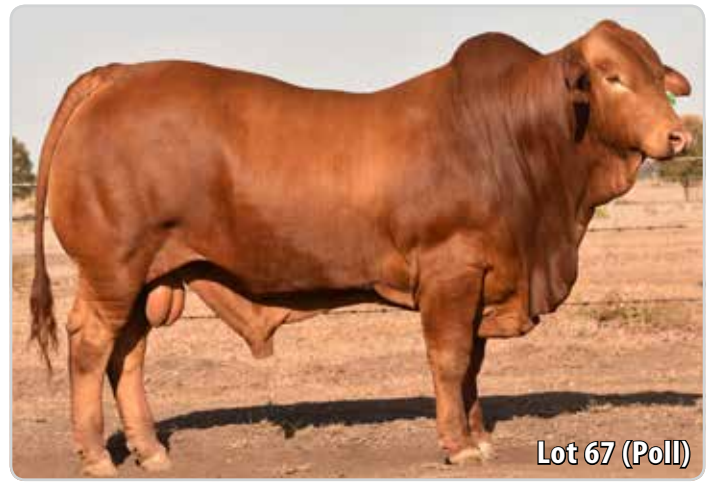
Lot 67 (Poll)