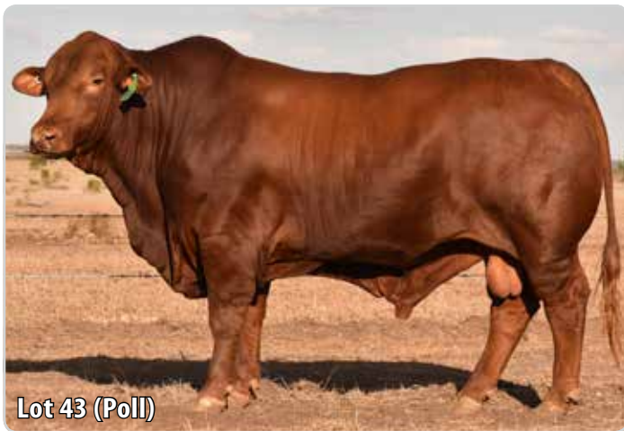
Lot 43 (Poll)