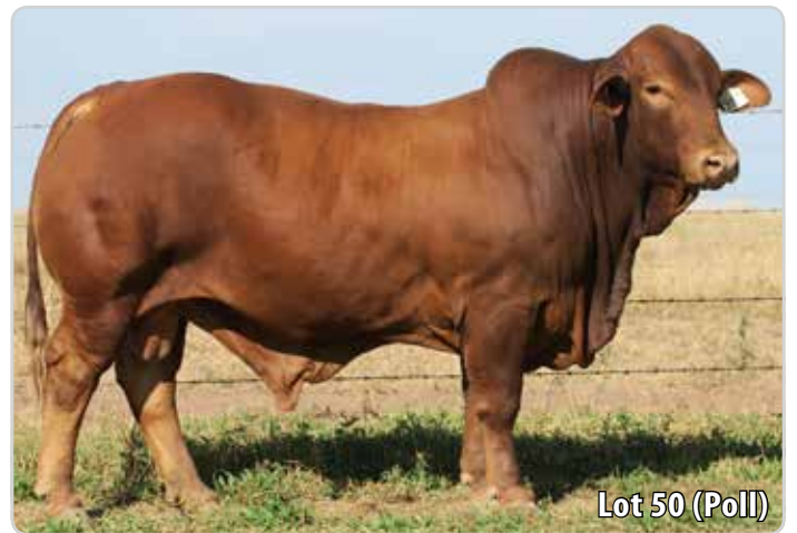
Lot 50 (Poll)