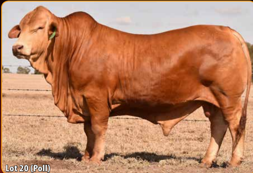
Lot 20 (Poll)