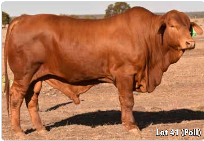
Lot 41 (Poll)