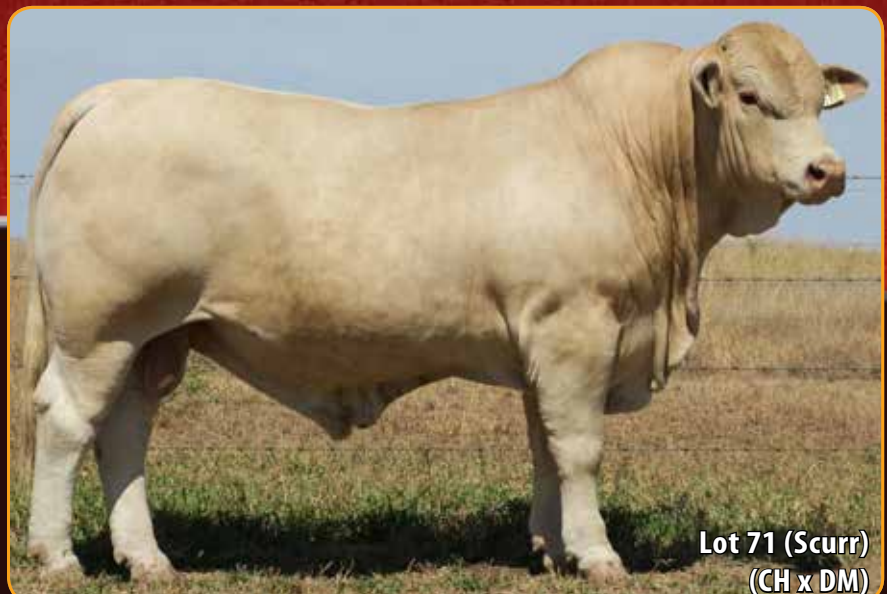
Lot 71 (Scurr) (CH x DM)

Dalrymple Saleyards Charters Towers North Queensland