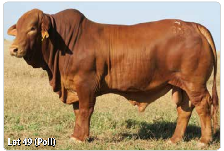
Lot 49 (Poll)