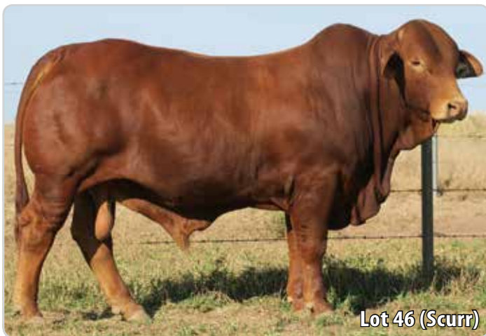
Lot 46 (Scurr)