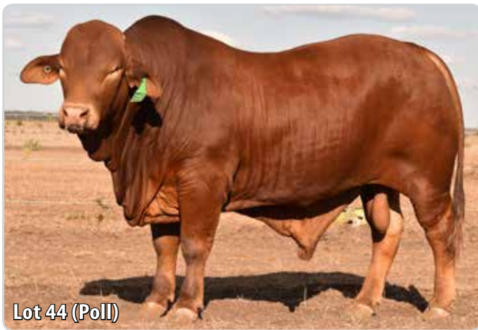
Lot 44 (Poll)