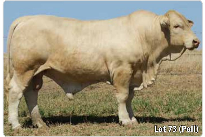
Lot 73 (Poll)