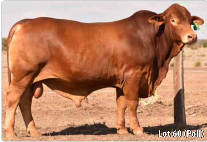
Lot 60 (Poll)