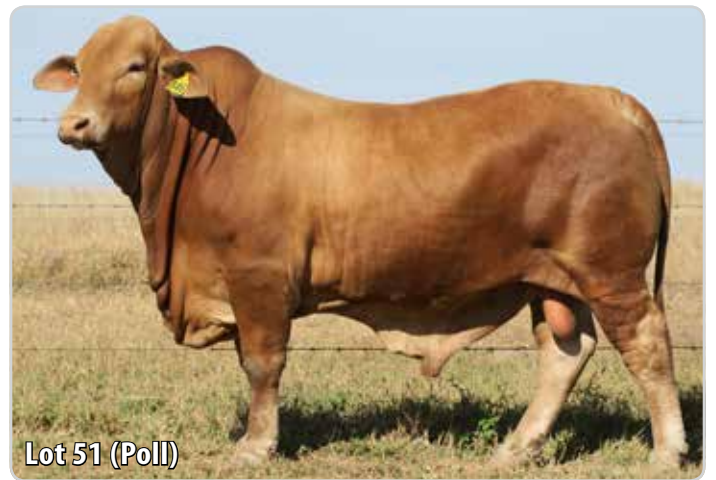
Lot 51 (Poll)