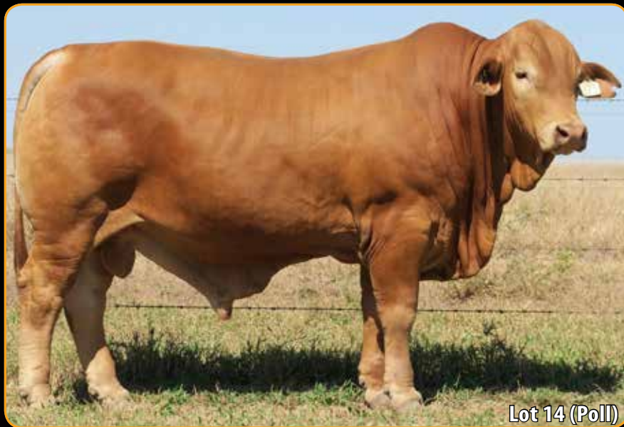
Lot 14 (Poll)